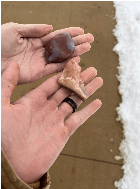
Photo of polished flint received for attending the event.